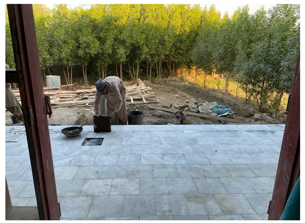
November 2022: The last tile - a construction worker adds finishing touches to the PAAS hospital verandah.

Left): The PPHI healthcare team sees patients at the PAAS hospital and prescribes medication provided by UNICEF for pneumonia and diarrhea in children under five.