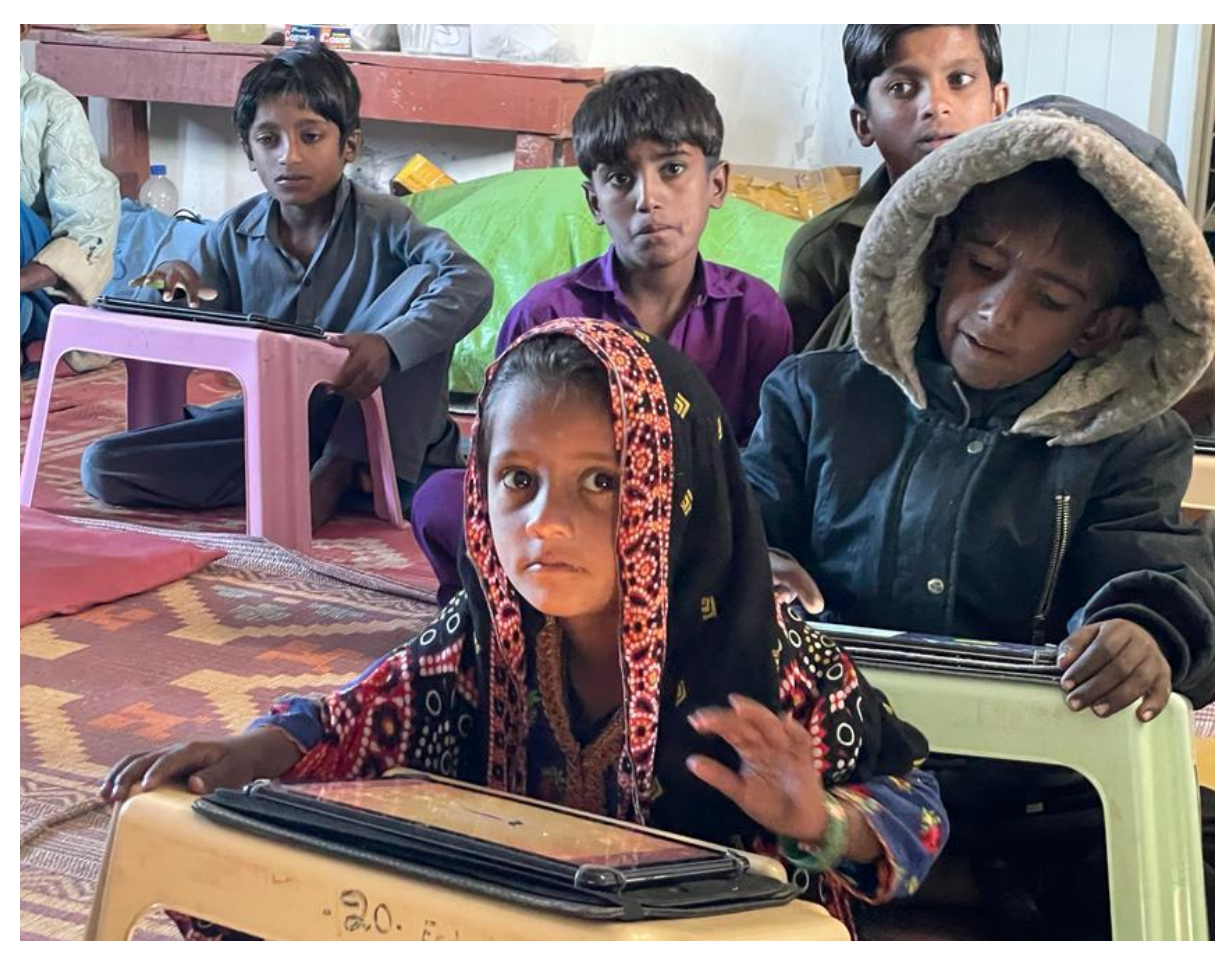
Students return to the classroom after the winter vacation.

Most of Sindh province in Pakistan is still dealing with the aftermath of the devastating floods of 2022, with entire villages rendered homeless. Although Deh Loon Khan fared better than some other areas, attendance at the PAAS micro-school went down in the last quarter of 2022 with many families migrating from the area and children finding it difficult to navigate to school through flooded fields. The attendance has slowly improved with around 80 of the original 100 children back in school for the new term.